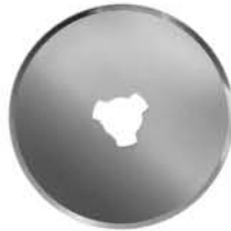
Textile Razor Slitter Olfa 28mm RB TGW #540011002