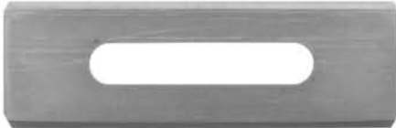
TiN Coated Round Edges Razor Blade 2.25 x .75 x .015 TGW #520022507T

Products shown are just a sampling of the many styles we have IN STOCK for immediate shipment. Please contact us for solutions to your specific requirements.